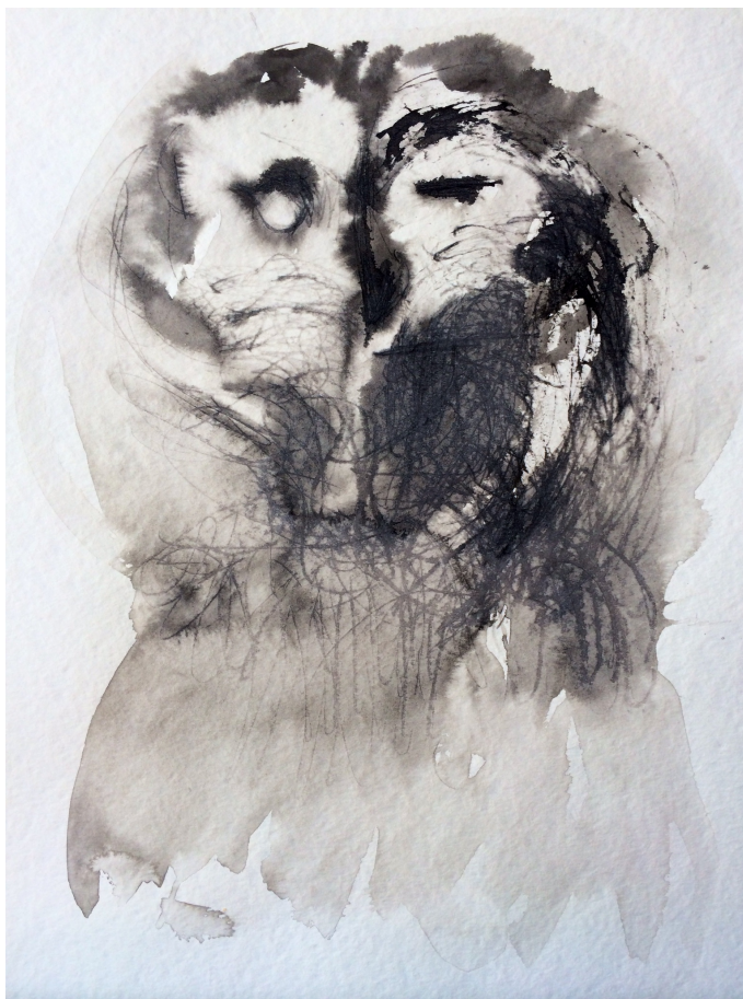
The Blind Owl Meets the Hunger Artist by Aphrodite Désirée Navab

On view September 21st - September 28th 2014